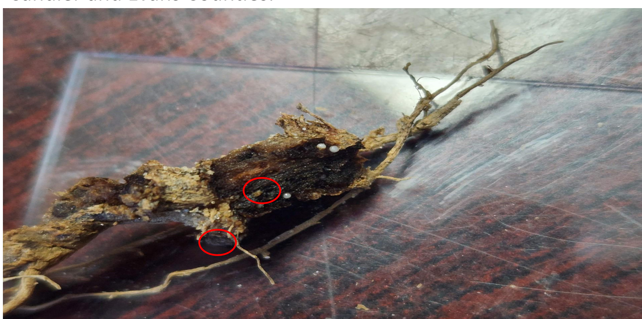
Figure 2. Root-knot nematodes adult females indicated by the red circle.