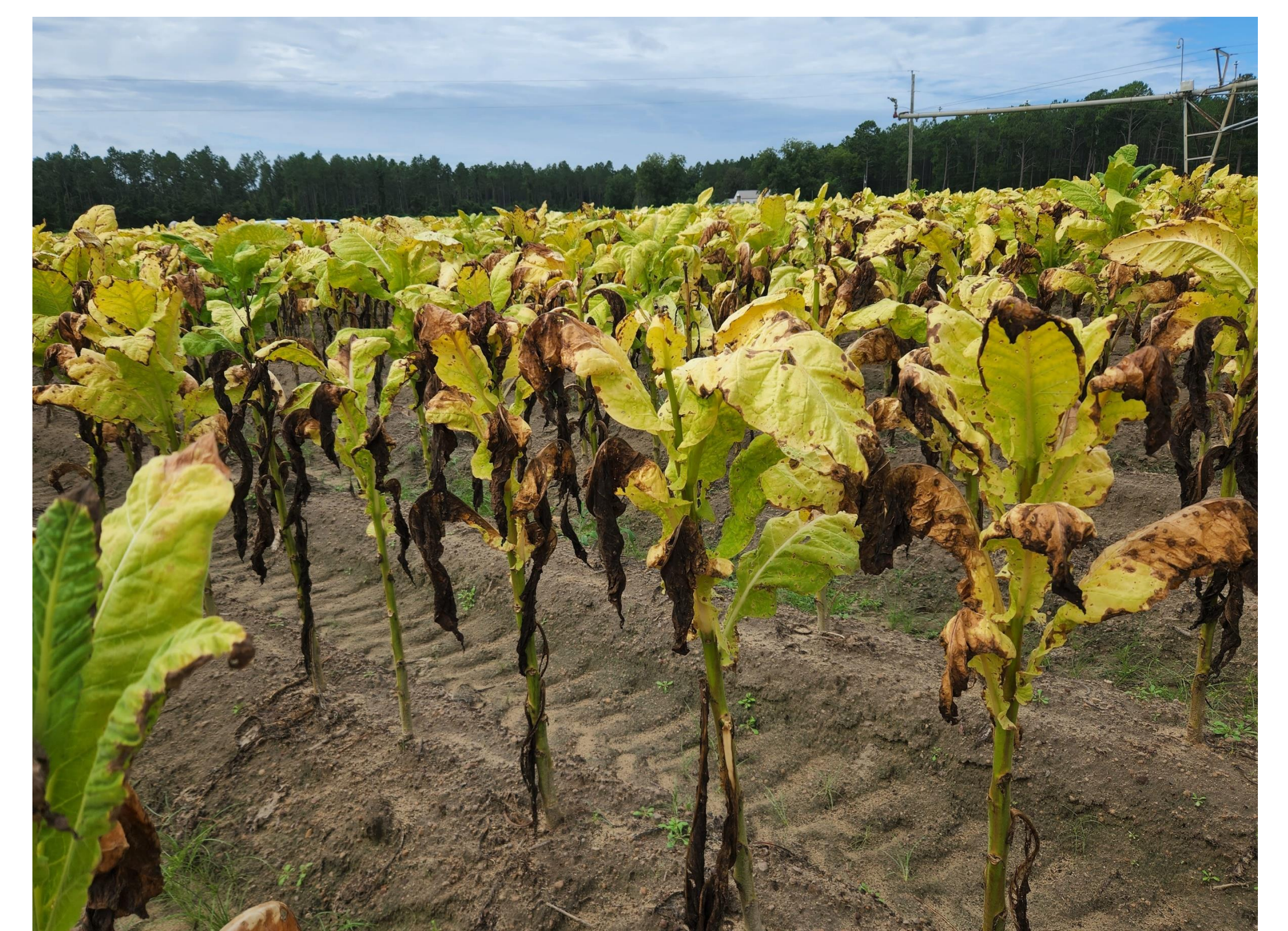
Figure 5. Tobacco with high counts of RKN.

Of the remaining non-RKN found, the most economically important is Lesion nematode, however, for the entire state this PPN only accounted for 8%. From the survey, it is evident that the most destructive and important PPN population in Georgia tobacco fields are RKN populations. According to previous literature, these appear to be the most economically important nematode affecting tobacco to date.