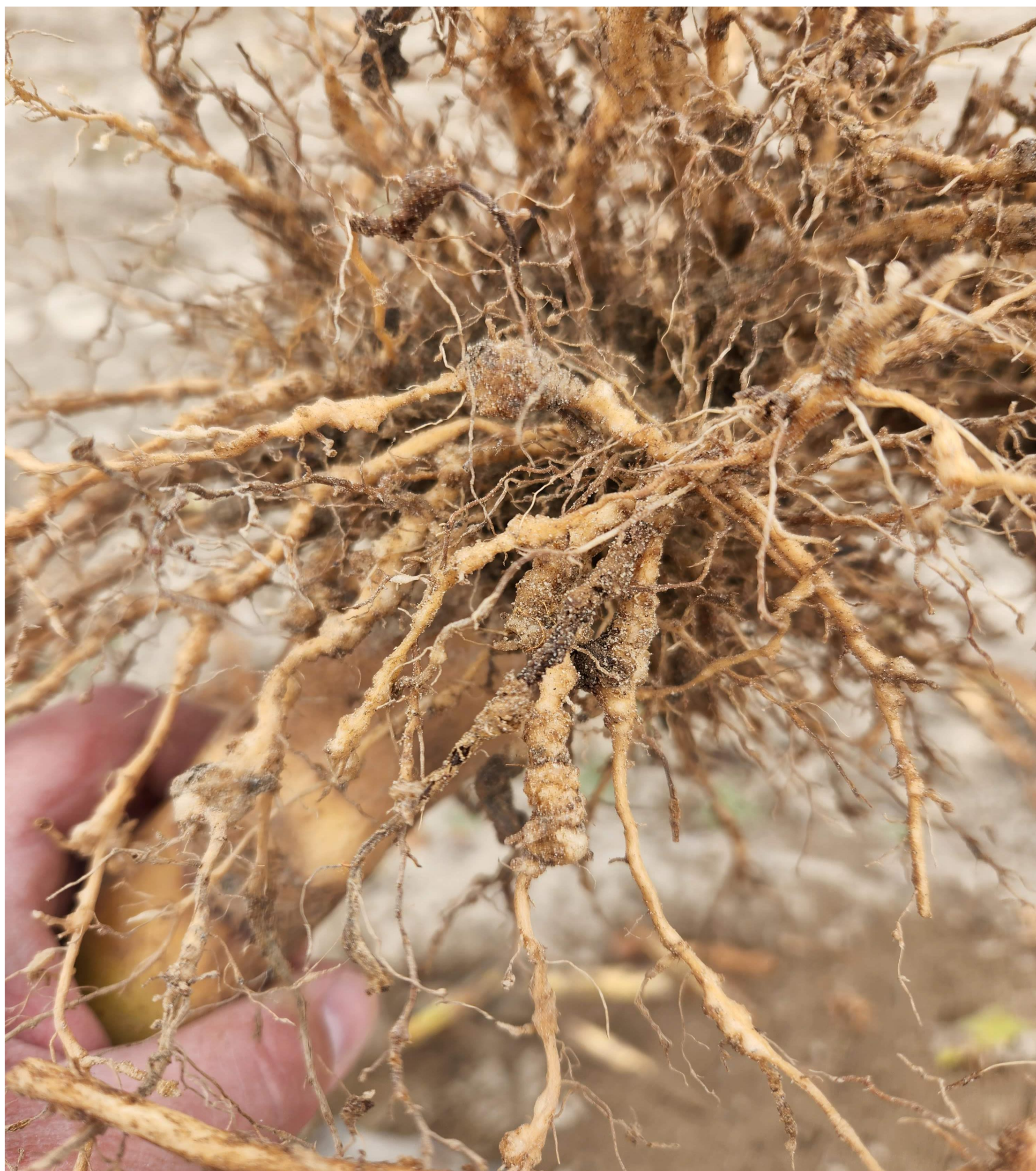
Figure 1. Tobacco roots with extensive galling caused by root-knot nematodes.